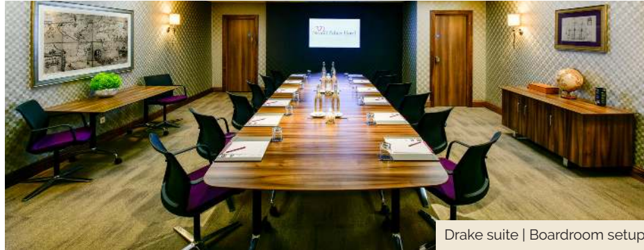
Drake suite | Boardroom setup